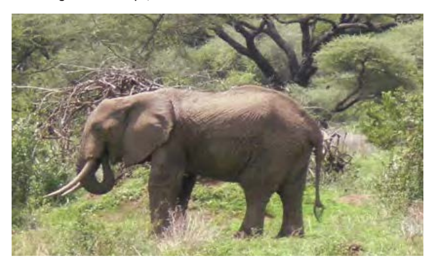
Photo 8- One of the big five, elephant (loxodonta africana) at Selous Game Reserve