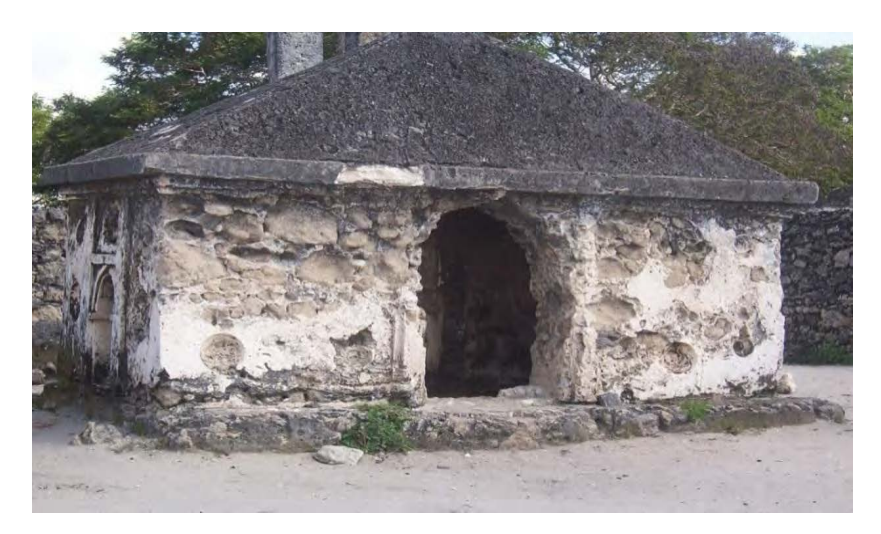
Photo 7- One of the Historical & Spiritual buildings at Kaole Ruins in Bagamoyo Town