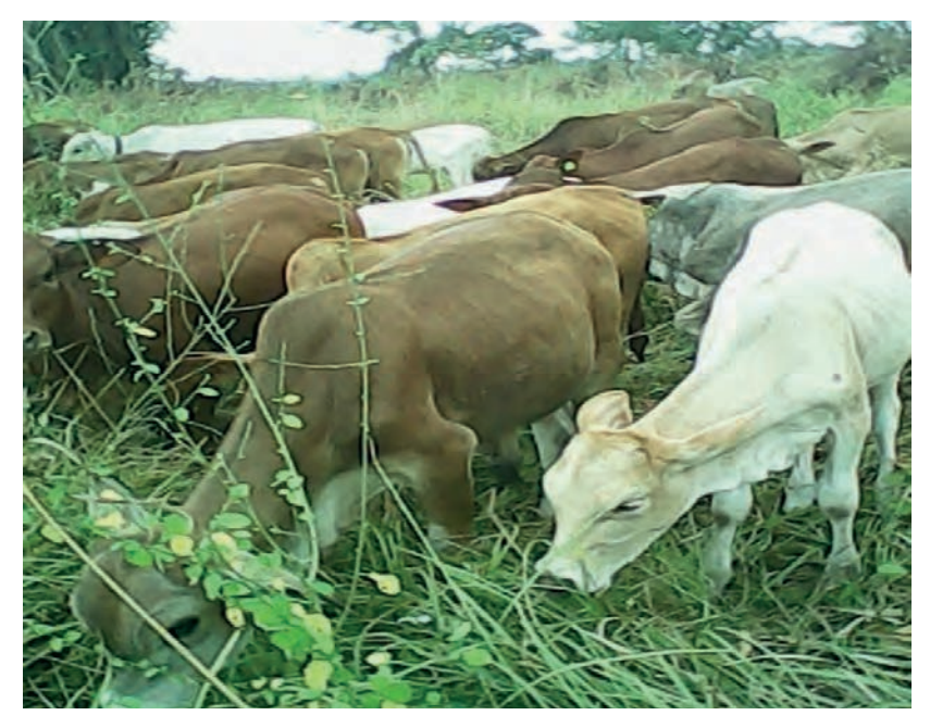
Photo 5- Group of 5 month calves cross breeds of Boran and Zebu cattle at Mafizi village in Kisarawe (Lushu ranching)

Livestock contributes 16 percent of Regional Growth Domestic Product (GDP). It is dominated by small holders' livestock keepers who raise mostly indigenous cattle, goats, sheep, pigs and chicken. Livestock products produced are beef, milk, eggs, skin and hides. The population of both local and improved livestock in the regional is estimated to be 455,300 cattle, 166,400 goats, 69200 sheep, 14781 pigs and 1,817,200 indigenous chicken and 336455 commercial chicken.